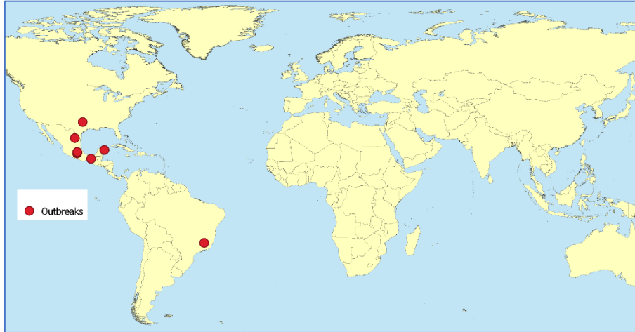
Figure 2. Worldwide recent distribution of SARS-CoV-2 outbreaks reported to WOA (01/08/2022 - 31/08/2022).

During the last month 15 outbreaks have been reported or updated by 3 countries (Brazil, Mexico, United States of America) in 4 animal species (cats, dogs, mandrill, South American Coati). The recent distribution of outbreaks is reported in Figure 2.