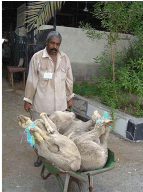
Paper presented at the Third OIE Global Conference on Animal Welfare, 6-8 November, 2012 Kuala Lumpur, Malaysia