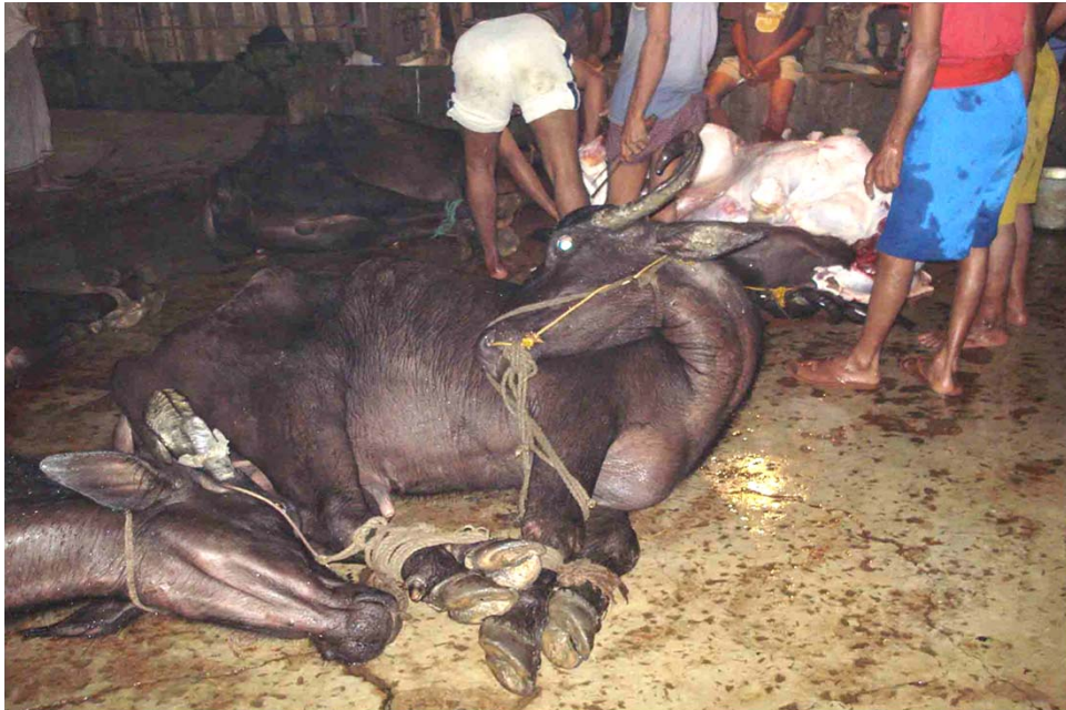
Paper presented at the Third OIE Global Conference on Animal Welfare, 6-8 November, 2012 Kuala Lumpur, Malaysia