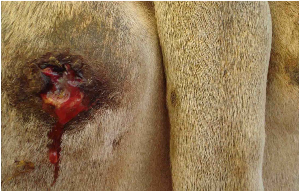
Paper presented at the World OIE Global Conference on Animal Welfare, 6-8 November, 2012 Kuala Lumpur, Malaysia